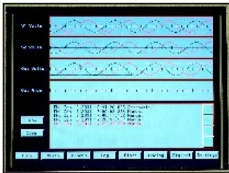
Color touch LCD screen with source identification