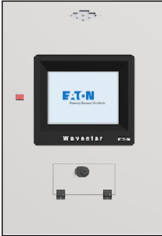
WaveStar display and redundant operator interface